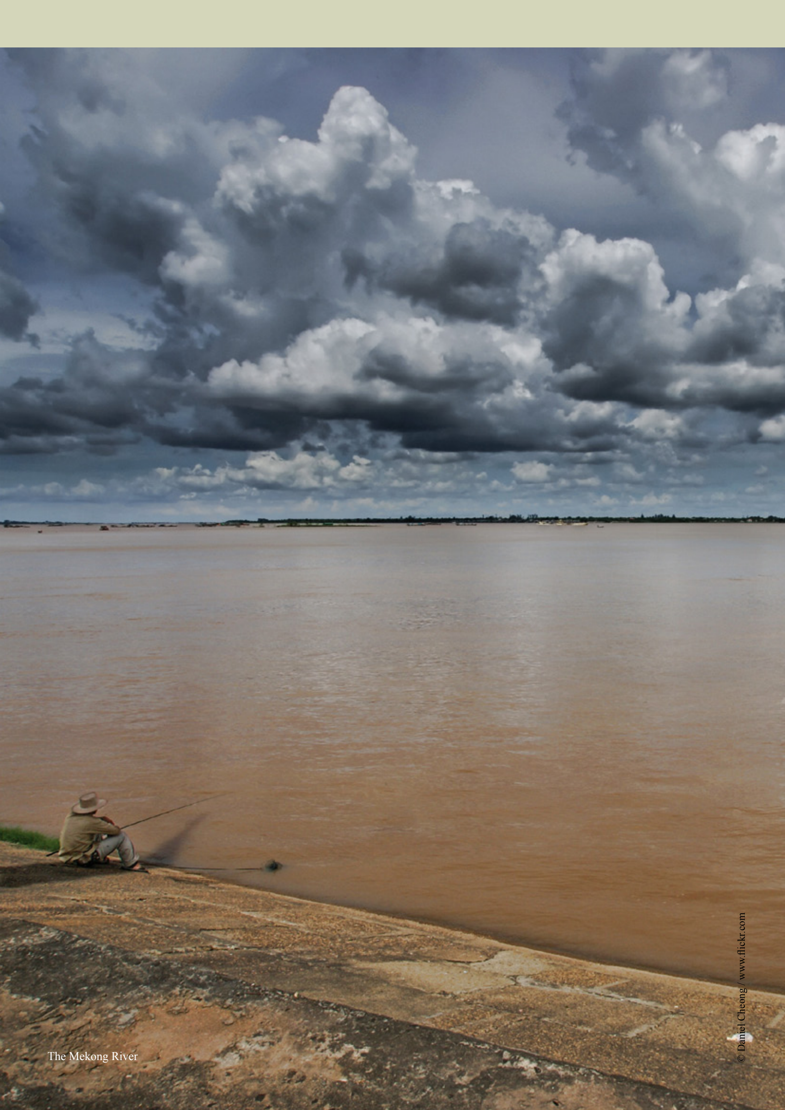
The Mekong River