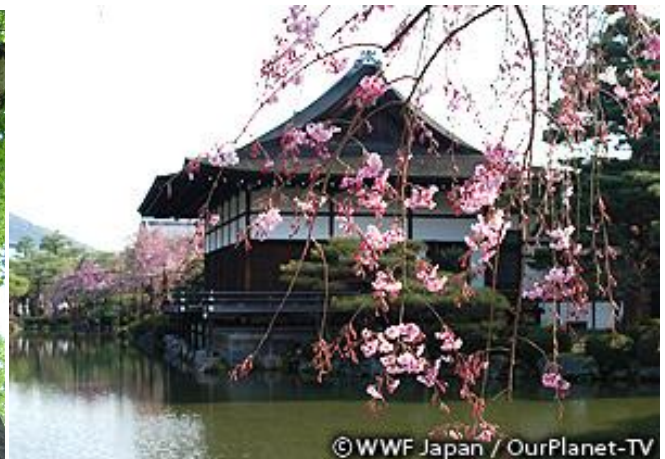
Cherry blossoms in Kyoto

The renowned World Heritage Site – the Shirakami-Sanchi beech forests in northern Japan– could decrease by a staggering 80% by the end of the century as a result of global warming.