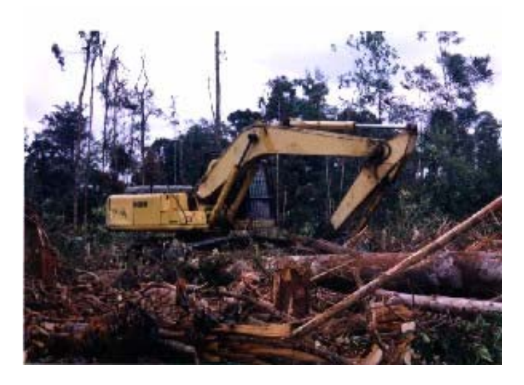
Figure 7. Excavator used in the professionally executed operations of Group 'W' (Photo taken on 1 June 2003)