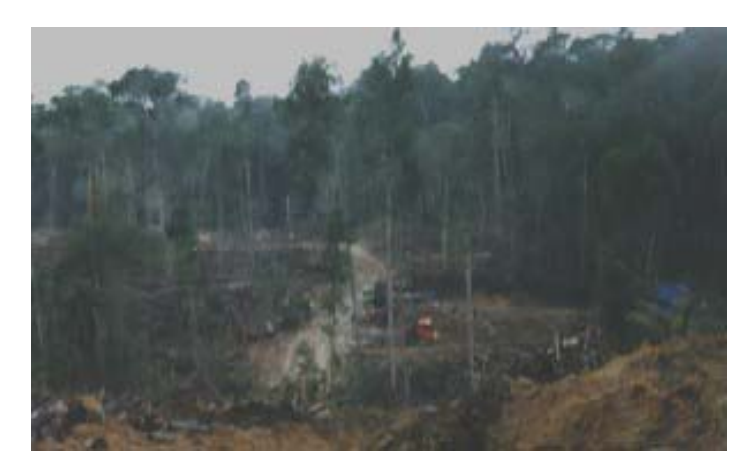
Figure 6. Logging site of Group 'W' (0°4'59.5" S, 101 °37'15.8"E) inside proposed Tesso Nilo National Park (Photo taken on 15 April 2004)

EQUIPMENT: In August 2003, Group 'W' used 2 excavators, 2 bulldozers and 5 logging trucks with license plates BM 9732 RB, BM 8481 AT, BM 8629 AT, BM 9579 AS and B 9029 RB. In April 2004, Group used 2 bulldozers, 1 excavator and 4 loggings trucks with license plates BM 9789 AB, BM 8885 AT, BM 9477 LA, and BM 8206 AS.