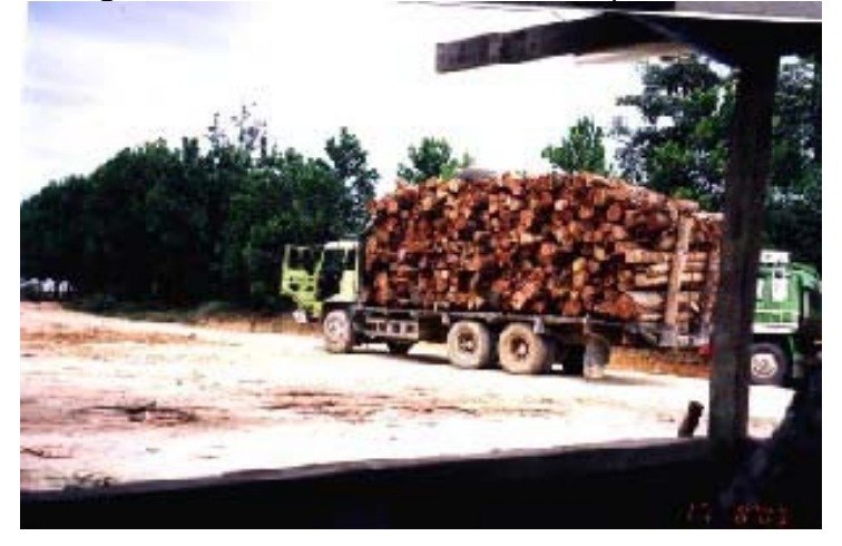
Figure 8. Truck BM 9732 AT rests at Camp 32 of Siak Raya Timber Corporation on 16 August 2003

16 August 2003, 18:30, the five trucks stop at restaurant in Simpang Koran (Fig. 1)