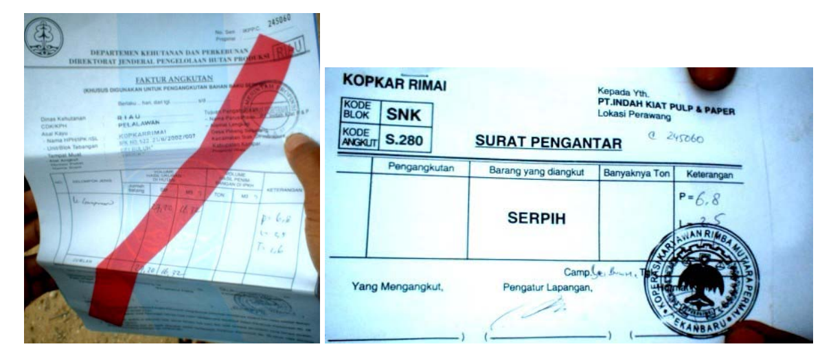
Figure 10. Timber Transportation Permit and Delivery Order used by Group 'W"s truck BM 9789 AB indicate a very different location of origin for the timber actually cut and loaded at the site inside the proposed Tesso Nilo National Park on 16 April 2004

17 April 2004, 18:05, truck BM 8885 AT arrives at Forest Resources Check Post at Minas Km 32. Truck BM 8885 AT presents a Timber Harvesting License with the following specification: