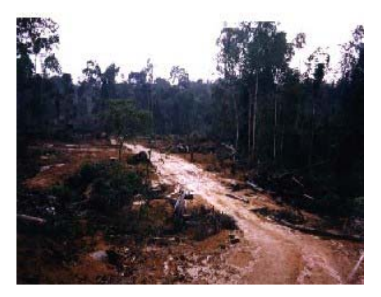
Figure 3. Logging site of Group 'P' (0°6'8.3" N, 101°33'24.2"E) inside proposed Tesso Nilo National Park (Photo taken on 14 August 2003)

EQUIPMENT: Group used 2 excavators, 1 bulldozer and 4 logging trucks with license plates BM 8763 AD, BK 8431 BD, BM 8879 AC. One plate remained unidentified.