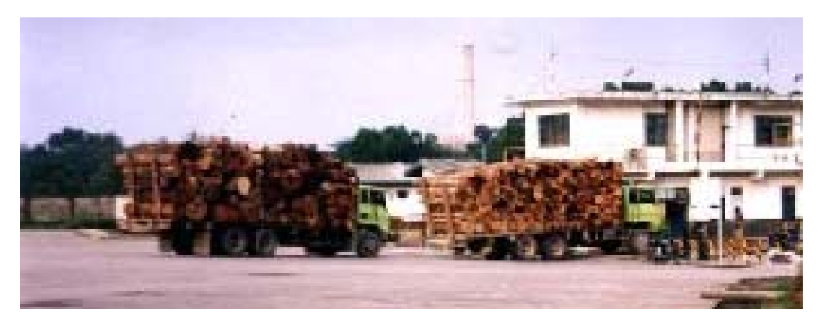
Figure 4. Trucks BM 8879 AC and BM 8763 AD enter the APP mill with wood cut inside proposed Tesso Nilo National Park (Photo taken on 15 August 2003)