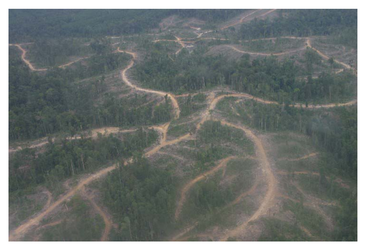
Figure 2b. 29 April 2004 photo of Group 'AJ" logging site inside proposed Tesso Nilo National Park.