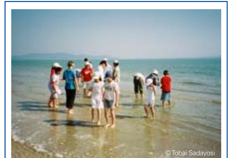
Will the next generation continue to enjoy a healthy Yellow Sea Ecoregion?

An ecoregional approach helps ensure that we do not overlook areas that are particularly unique or threatened, allowing for smarter trade-offs and greater positive impacts that are more likely to endure over time.