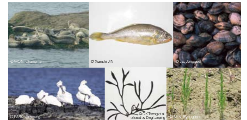
Biodiversity of Yellow Sea Ecoregion