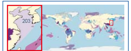
(203) Yellow Sea Ecoregion

Meanwhile, in 2002, WWF and other research institutes in China, South Korea and Japan began an assessment of Yellow Sea Ecoregion biodiversity. The objective of this regional partnership was to prioritise conservation actions based on scientific data.