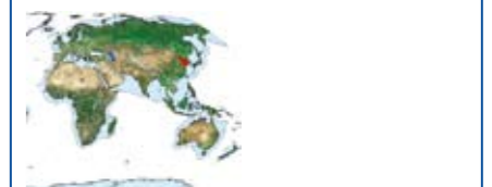
LME #48 Yellow Sea Large Marine Ecosystem