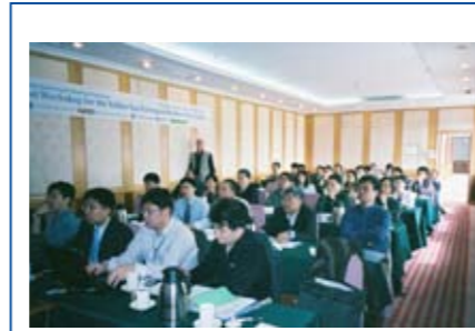
Scientific experts from China, South Korea, Japan and other countries cooperated to analyse priority areas

Finally, the scientists checked that all major habitat types were included in the list of Potential Priority Areas. An Ecologically Important Area that covered an unrepresented habitat type (cold water mass) was added to the list.