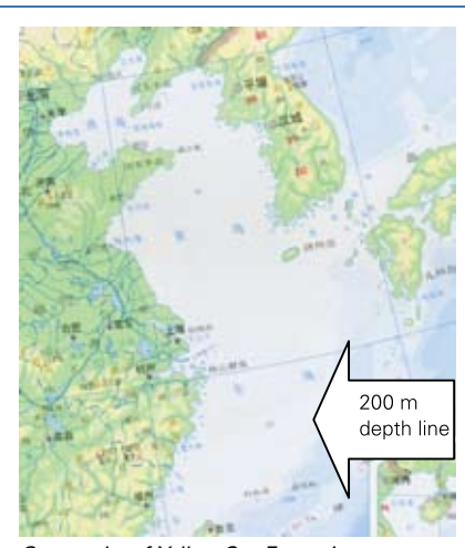
Geography of Yellow Sea Ecoregion

In South Korea, a total of 395 species of algae have been identified, which consist of 43 species of blue-green algae, 45 species of green algae, 90 species of brown algae, and 217 species of red algae species. Among phytoplankton groups, Bacillariophyta had highest number of species (312 species)