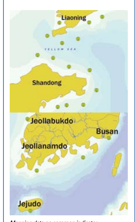
Mapping data on common indicator species, Silvetia siliquosa and its ecologically important areas in China and South Korea