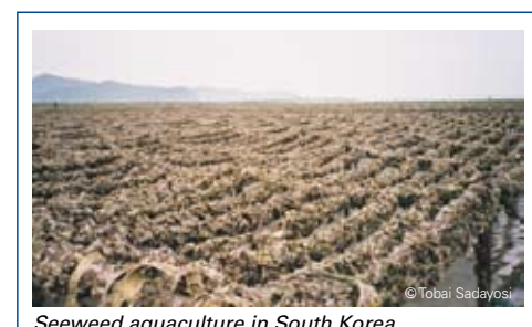
Seeweed aquaculture in South Korea

Some species such as Silvetia siliquosa has reduced its distribution due to water pollution. Construction of dams in estuaries has impacted culture of nori seaweed because of reduction in nitrogen and big changes in salinity. Over-harvesting has also affected some algae species.