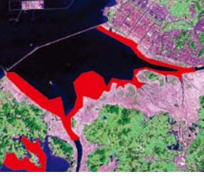
important bird habitat in South Korea

and local government agencies, legislative bodies, non-government organisations including religious groups, the general public, the media, donor communities, industries, consumers, and vouth groups all have important roles to play. For example, national and local government agencies can contribute by strengthening crosssectoral coordination in the establishment and improvement of the management of marine protected areas (MPAs). Filling major knowledge gaps in ecology and human impacts on indicator species is also an important action to take.