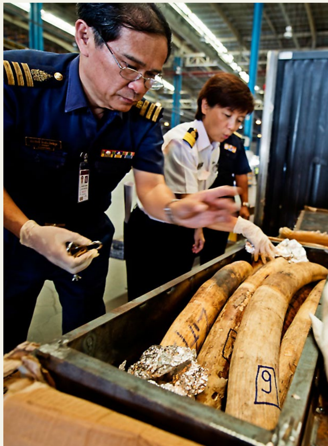
Customs officials in Suvarnabhumi airport, Bangkok (Thailand), discover a shipment of African elephant tusks from Mozambique.