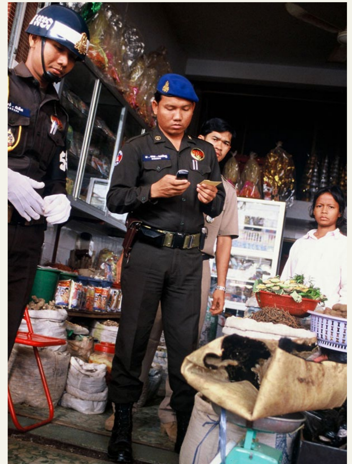
A Forestry Department official inspects, photographs and weighs an Asiatic bear skin found for sale in a store selling herbal products, Phnom Penh, Cambodia.