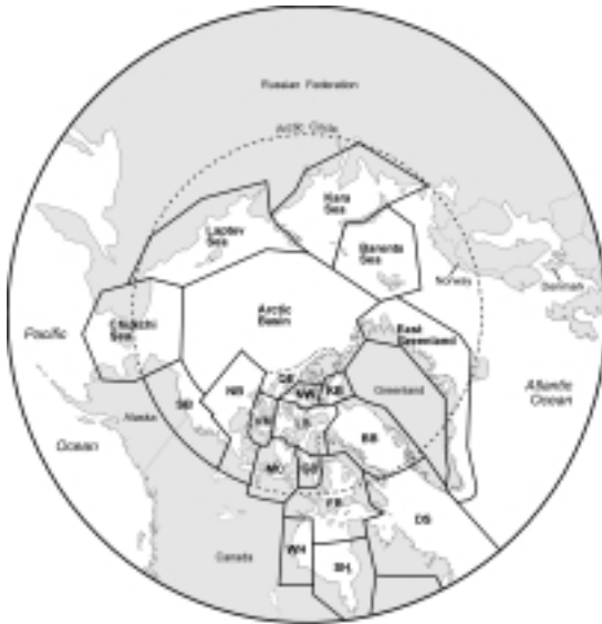
Figure 1: Circumpolar distribution of polar bear populations.

Polar bears are distributed throughout the circumpolar arctic in 20 relatively distinct populations that vary in size from a few hundred to a few thousand individuals (Figure 1, Table 1). There are estimated to be at least 22,000 polar bears worldwide, with about 60 per cent occurring in Canada.