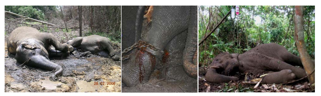
Figure 1-- A direct consequence of forest loss: elephant family poisoned near Mahato village in February 2006; one of the ten elephants captured near Libo Forest Block and abandoned without food, water or medical care in March 2006; first of the ten elephants who died on 14 April from tetanus infection in leg wounds cut by extremely tight and rusty chains (Photos: Samsuardi/WWF Indonesia).

Poisoned, shot and captured, they have been disappearing as fast as their forests<sup>7</sup> (Figure 1). After a series of high profile elephant killings in late 2005 and early 2006, the Indonesian Minister of Forestry decided to prioritize elephant conservation in Riau Province. Elephant conservation means habitat protection. Habitat protection means forest conservation. Forests important for elephants are high conservation value forests.