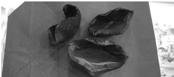
Processed pangolin scales at a traditional Chinese medicine shop in Kunming.

These preliminary data suggest that a more extensive investigation of pangolin trade in southern China could well reveal the dimensions of an increasing, possibly unsustainable trade with impact in areas of high biodiversity in countries such as Viet Nam, Malaysia and Indonesia. Such investigations will be undertaken by TRAFFIC in 2007.