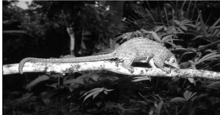
Long-tailed pangolin Manis tetradactyla are heavily hunted despite legal protection.

长尾穿山甲（拉丁文名： Manis tetradactyla ）虽然属于受法律保护的动物，但仍然遭到严重猎杀。