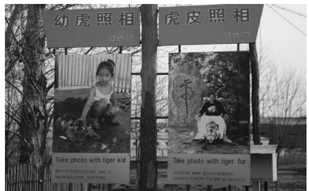
Advertisement at the Hengdao River Breeding Center in Heilongjiang province.