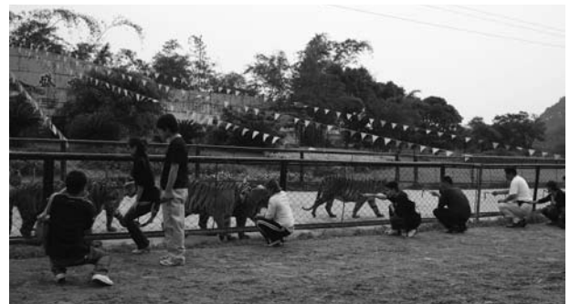
Tourists feed tigers at the Xionsen Bear and Tiger Mountain Village near Guilin, Guangxi province.

如欲更全面的了解这些问题，请登录网站(traffic.org)查阅野生生物贸易研究委员会报告：《遏制老虎贸易：1993年国内贸易禁令后的中国野生虎和圈养虎产品市场》。如欲进一步了解“保护老虎联盟”的信息，请登录“拯救老虎基金会”网站(savethetigerfund.org)。